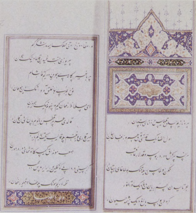
10. Baykara, Sultan Hüseyin. Divan . Turkish, 96 leaves. Talik. (Herat gilding). (Ayasofya 3911)