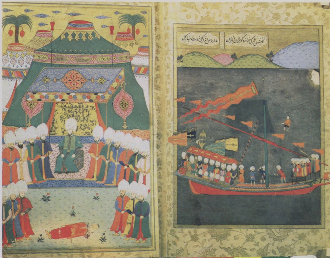
3. Kelâmi. Vekayi-i Ali Paşa. Turkish, 1-61 leaves, Talik. (Halet Efendi 612)