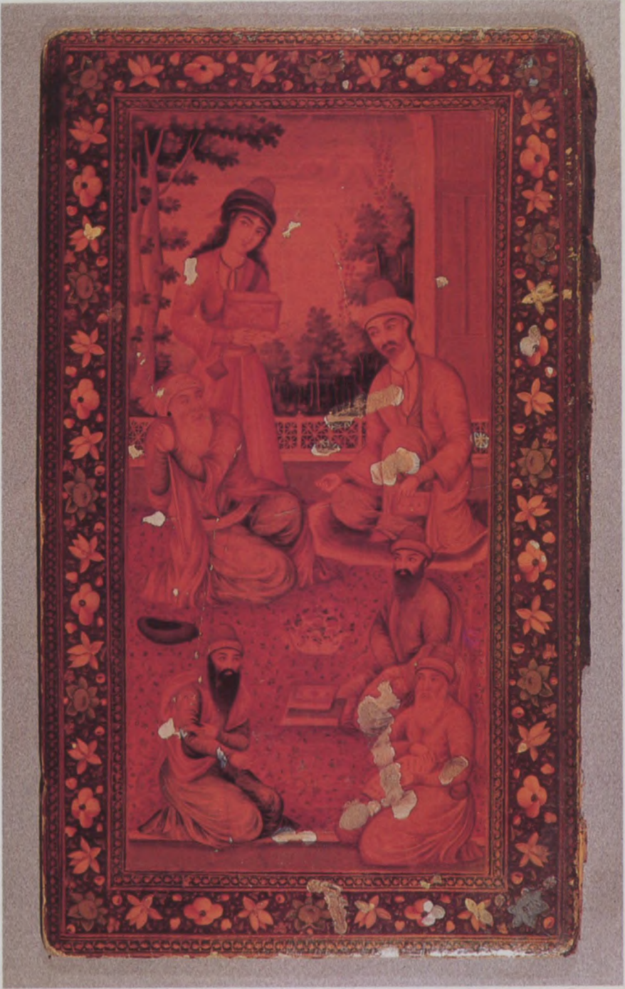
4. Sa'di-yi Şirazi, Muslihad-din Sa'di b. Abdullah. Persian, 1008 H. 322 leaves. (Cover, lacquered binding) (Muğla Hoca Mustafa Efendi 84)