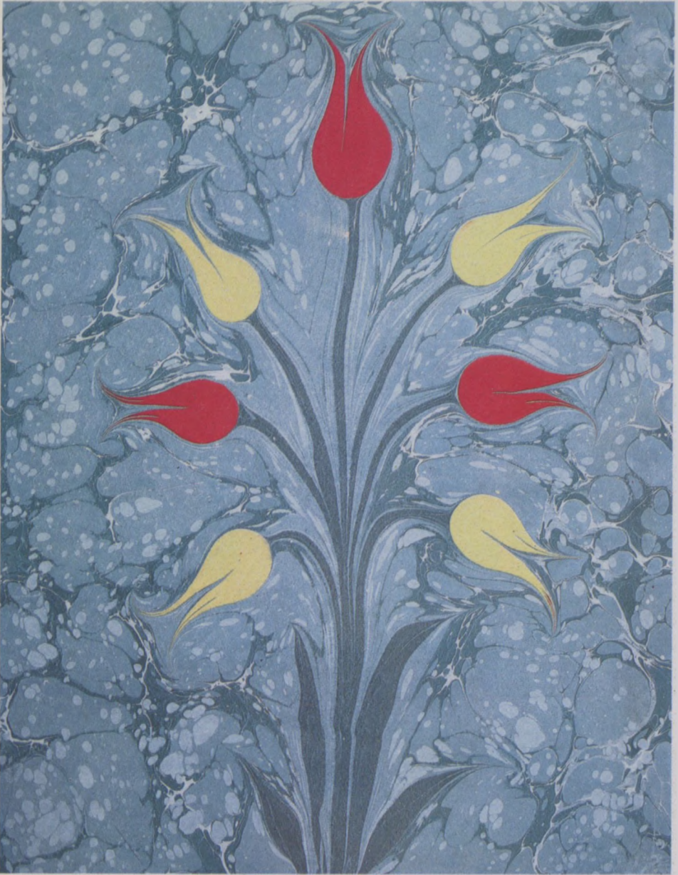
1. Marble paper