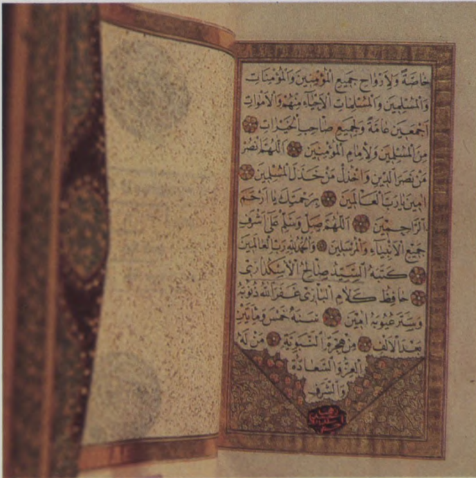
9. Qoran . Arabic, 358 leaves, 1205 H. Üsküdarlı Salih. (signature of the gilder. Hasan el-Üsküdari). (Pertevniyal)