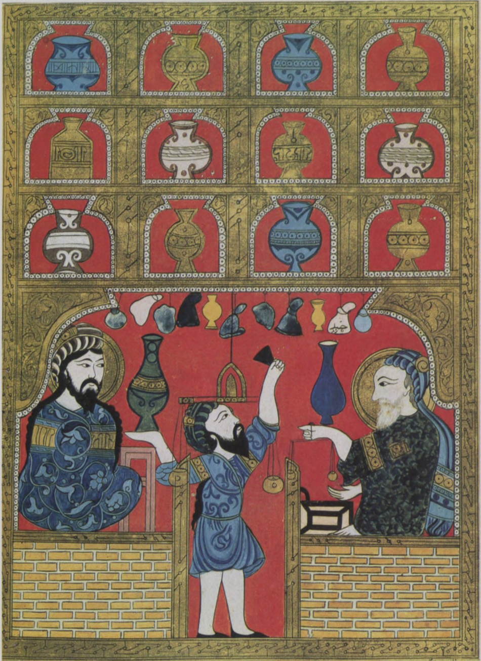
2. İstefan b. Basil Kitabü'l-Haşayiş fi't-Tıp . Arabic, 154 leaves, Nesih. (Ayasofya 3703)