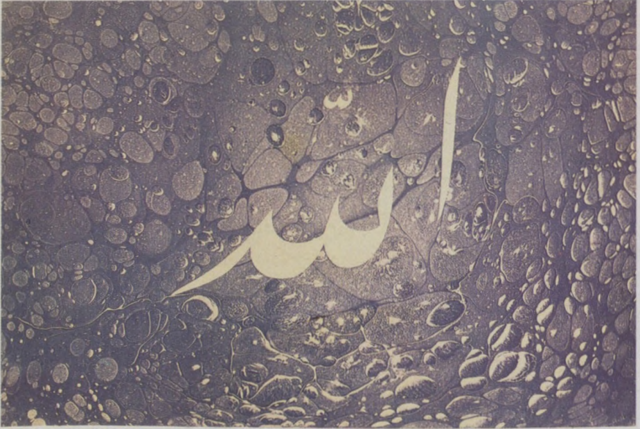
8. Calligraphy on marble paper by Necmeddin Okyay