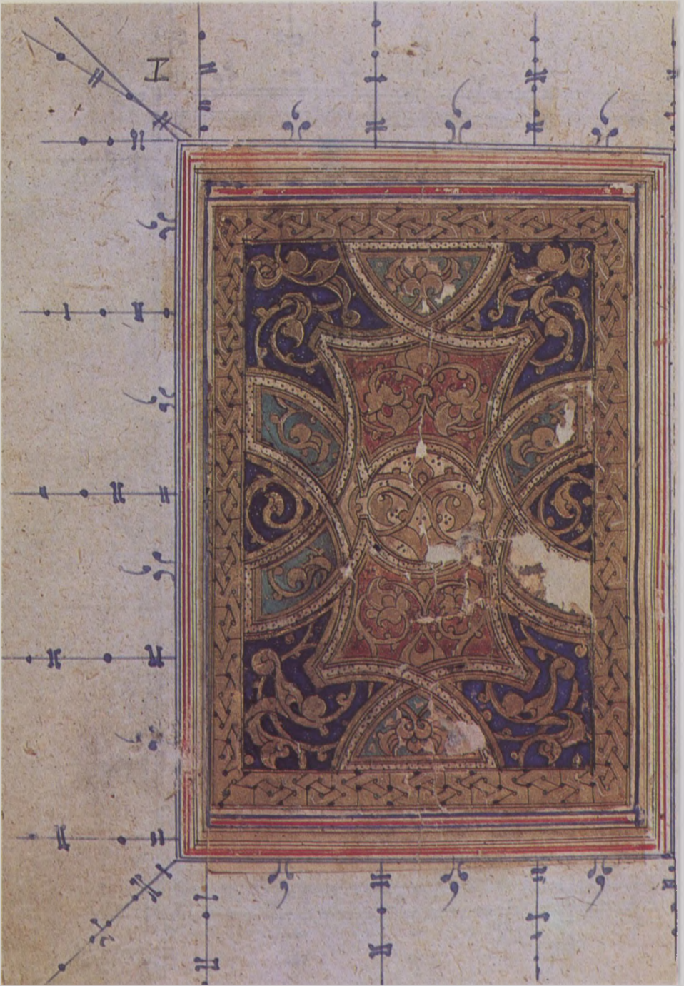
5. Seljuki gilding, Ed'iyet al-Eyyam al-Seb'a . Arabic. 682 H. Yakut el-Mustasimi. Sülüs-Nesih 18 leaves. (Ayasofya 2765)